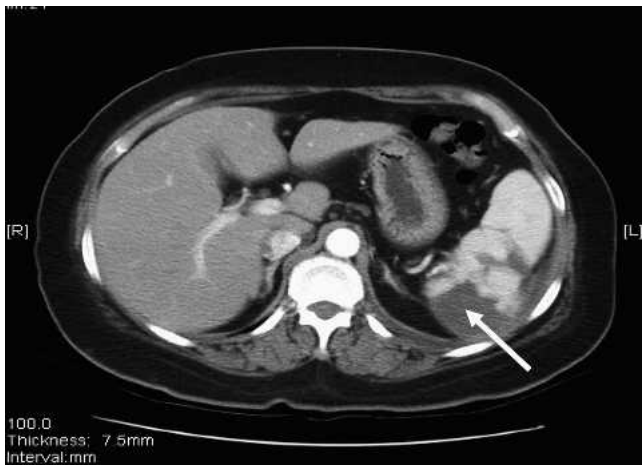
FIG. 2. Abdominal CT shows partial infarction of the spleen (arrow) at three months after angioembolization.

in four patients and large hemoperitoneum in six patients. In comparison, CT scans of 13 patients in Group B who became hemodynamically unstable during abdominal CT scans showed contrast extravasation in five patients and large hemoperitoneum in seven patients. The last patient had a grade III splenic injury. Ten patients in Group B who remained hemodynamically stable underwent SAE, and CT scans of these patients showed either contrast extravasation (8 patients) or large hemoperitoneum (2 patients). The procedure was successful and controlled the bleeding in eight patients including six with contrast extravasation and two with large hemoperitoneum. Seven of them had intrasplenic vessels embolized and the other patient had a main artery embolized for bleeding control. One patient began to bleed 12 hours after SAE. The other patient's bleeding was unable to be controlled due to technical difficulties. Follow-up images of these eight successfully embolized patients showed partial splenic infarctions at three months after the procedure (Fig. 2), but a complete resolution of the infarction by the sixth month.